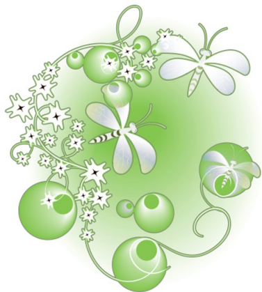
Illustration with dragonflies and flowers on light background by Irina Voloshina.

MAID is not an advance healthcare directive.