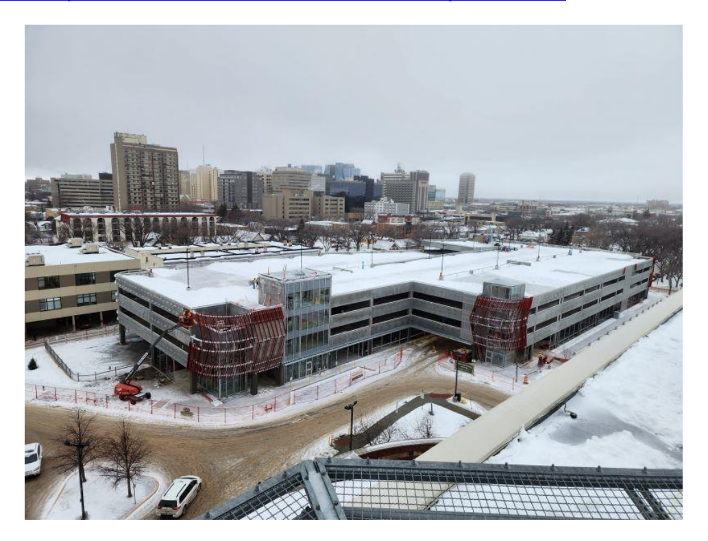
The Regina General Hospital Parkade officially opened December 16, providing safer, more convenient parking for patients, visitors and staff.

View this story on the SHA website, and share it with family and friends.